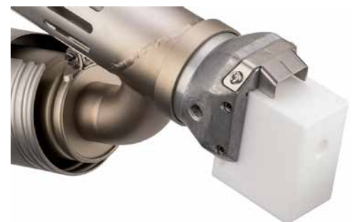
Welding shoe assembly