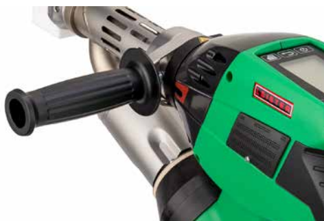
Various ways to hold